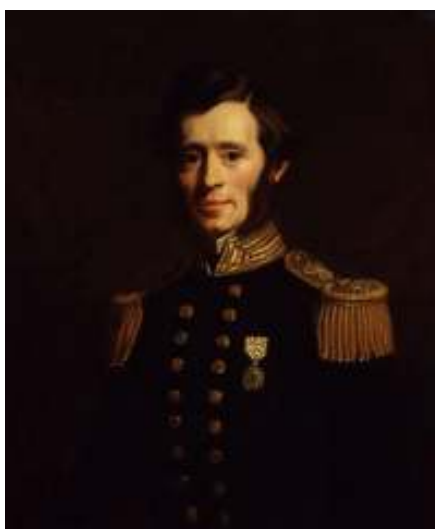
Captain Francis Leopold McLintock

Captain McLintock again left on the 14 th August for Frederickshaal, where it appears he was desirous of commencing the soundings across to the Labrador coast."